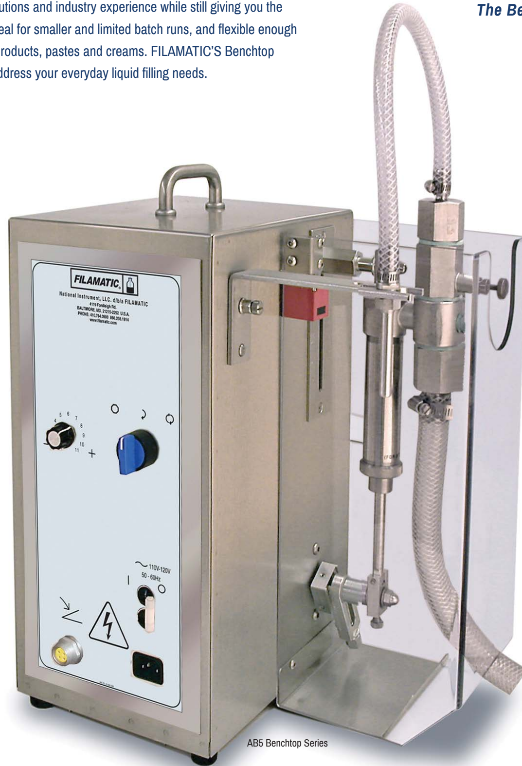
AB5 Benchtop Series