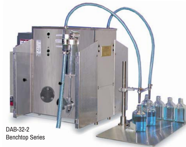
DAB-32-2 Benchtop Series

Your trusted industry packaging partner... it's time you empowered your production team with FILAMATIC'S unique performance, undeniable quality and unrivaled support before and after-the-sale. You can go further and do more with FILAMATIC.