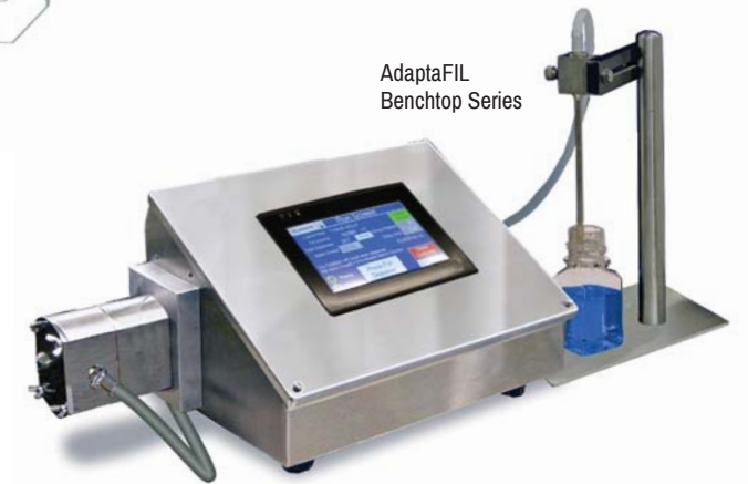
AdaptaFIL Benchtop Series

FILAMATIC also gives you a range of Benchtops that offer Peristaltic pump specific solutions. The AdaptaFIL and SmartFIL are well-known for their recipe control, quick and easy changeovers and a user-friendly HMI touchscreen. These solutions give you the ability to add multiple pumps, or even choose among different Peristaltic brands. The AdaptaFIL and SmartFIL are high-quality, reliable and affordable Benchtop options.