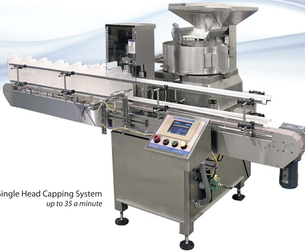
Single Head Capping System up to 35 a minute