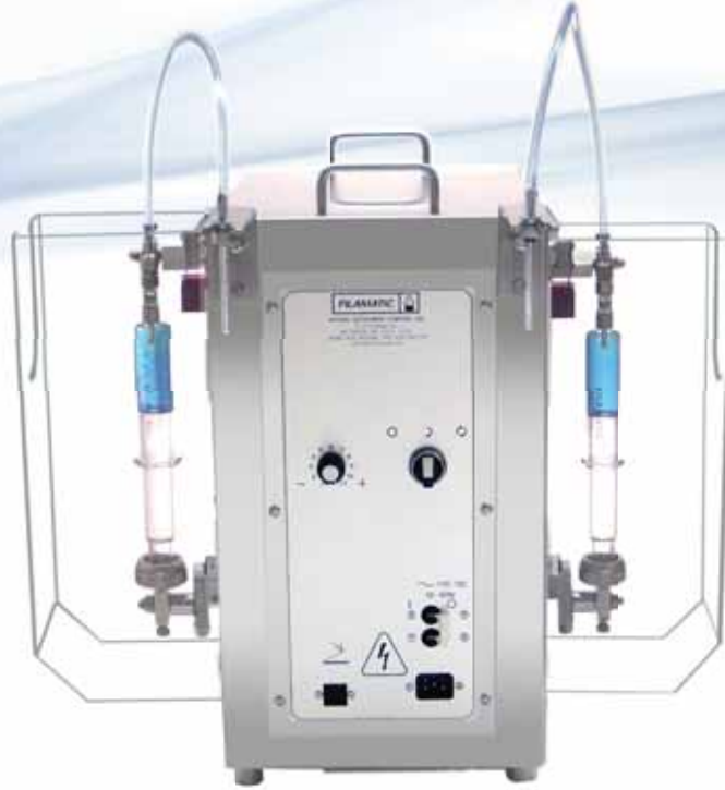
DAB Series Medium Duty Benchtop Filler